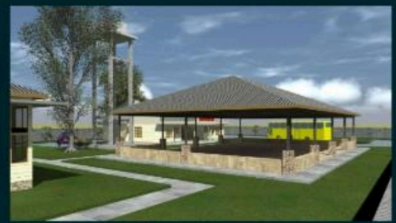
Lenkai High School Design - Pavillion