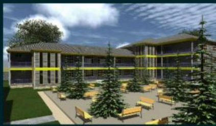
Lenkai High School Design - Senior Class Block