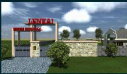
Lenkai High School Design - Front Gate