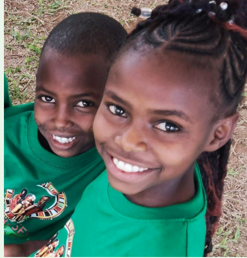
ACF SCHOLARSHIP FUND

This is a huge step for Amboseli Children's Fund - and only possible because of the kind generosity of our donors!