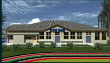
Lenkai High School Design - Dining Hall