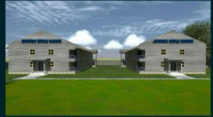
Lenkai High School Design - Girls Dormitories