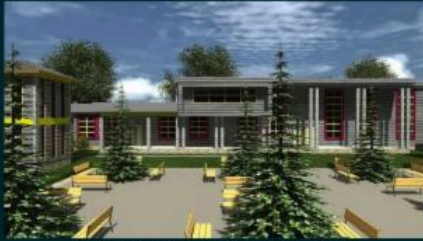
Lenkai High School Design - Library