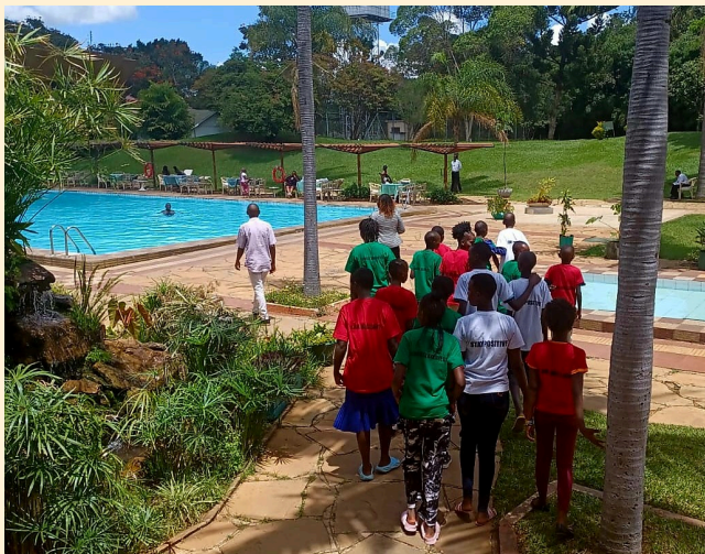
Hospitality services - these are the grounds of Utalii College!