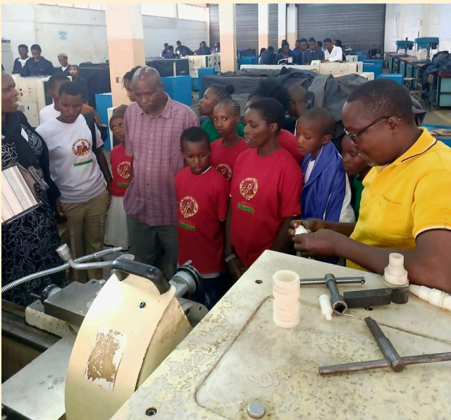
Mechanical Engineering at TUK - Technical University of Kenya