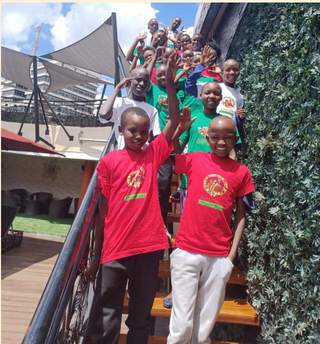
Best Western Meridian Hotel in downtown Nairobi