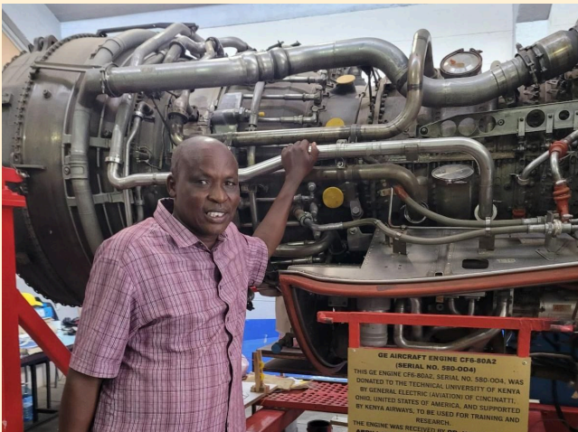
Aircraft engine at TUK - Technical University of Kenya